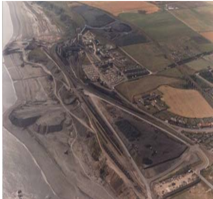
View of the former Dawdon Colliery

We consider the Dawdon scheme to be an extremely strong candidate for this award given the unique multi-disciplinary nature of the project, the engineering challenges overcome and the environmental and community benefit that has accrued.