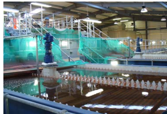
View of treatment system

Sludge formed is then recycled into the first stage with excess sludge transferred to holding tanks prior to dewatering in a filter press. As part of the design development a pilot plant study was undertaken to optimise the process. This resulted in a number of innovations to reduce reagent use, reduce sludge generation and reduce Health and Safety issues with chemical delivery.