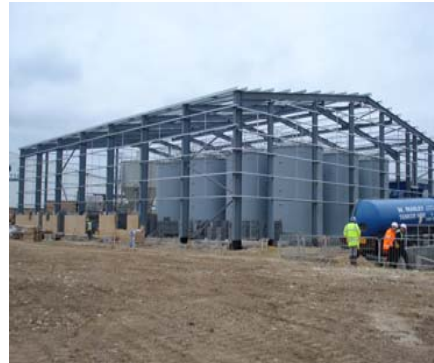
Dawdon Building during Construction

A value engineering process was undertaken. This realised some significant savings, for example removal of a fourth process stream whilst retaining the infrastructure to enable retrofitting. The process tanks were placed in a lowered area within the floor slab; thus enabling the height of the building to be reduced.